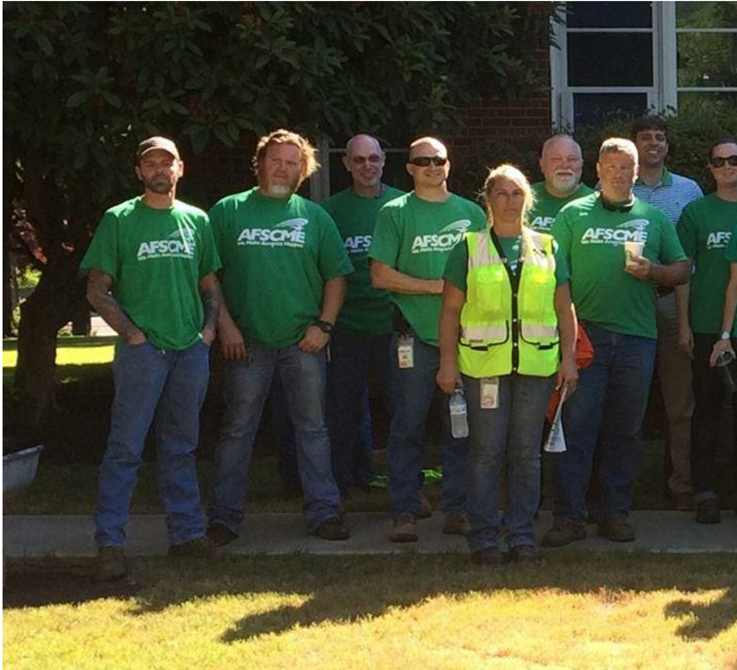
Rally for Our Milwaukie October 20, 5:45pm at Milwaukie City Hall 10722 SE Main Street in Milwaukie

AFSCME Milwaukie Local has struggled to attain a fair contract. The City has ceased negotiation and is unwilling to bargain leaving workers without a contract for over three months. The Mayor has been making anti-union comments and we need to show him that is NOT okay! Join in support of Milwaukie workers!